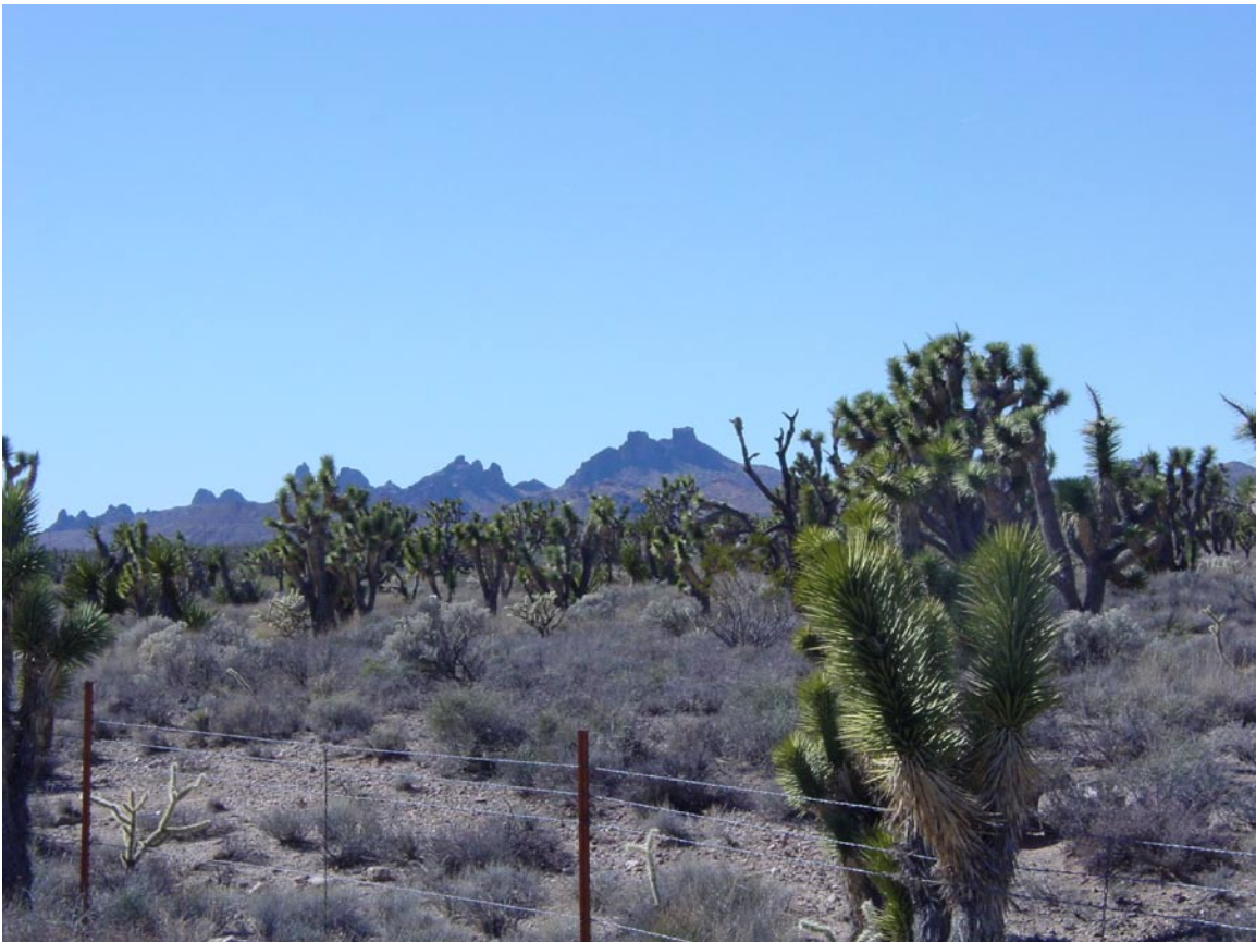
Bendire's Thrasher habitat in southern Nevada.

References: 1 Clark County (2000); 2 England and Laudenslayer (1989); 3 England and Laudenslayer (1993); 4 GBBO unpublished Atlas data; 5 Rich et al. (2004); 6 Shuford and Gardali (2009); 7 Sauer et al. (2008); EO Expert opinion